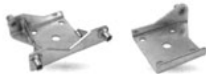
LOWER SPRING PLATES 2-POSITION CO LH STEEL CO RH STEEL