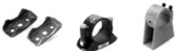
LEAF SPRING PLATES WELD ON FOR 3" AXLE TUBE CLAMP ON FOR 3" TUBE ALUMINUM CLAMP ON PAD