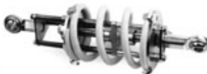
TWO WAY TORQUE LINK