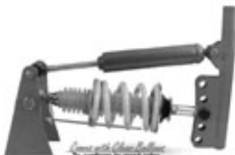
AFCO IMCA SPRING LOADED TORQUE LINK