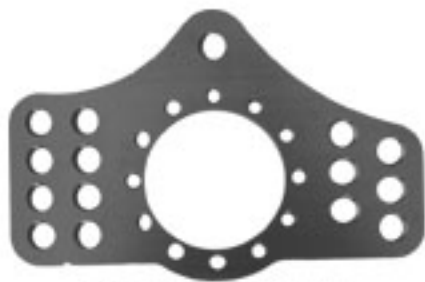
PINION MT. PLATE