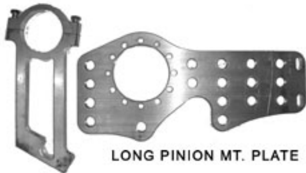
LONG PINION MT. PLATE