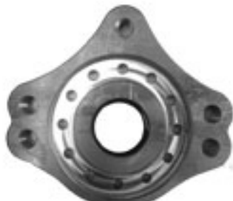
PINION MT. PLATE W/SEAL