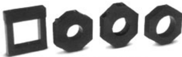
2" SQUARE BALLAST CLAMP 2" ROUND BALLAST CLAMP 1-3/4" ROUND BALLAST CLAMP 1-1/2" ROUND BALLAST CLAMP 1-1/4" ROUND BALLAST CLAMP