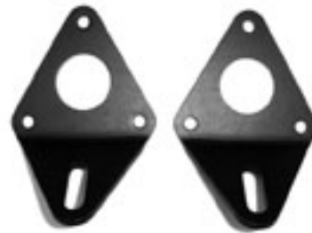
ROCKET ALUM. FRONT CHEVY MOUNTS