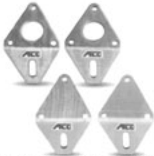
CHEVY FRONT ENGINE MOUNTS STEEL FRONT PAIR ALUM. FRONT PAIR