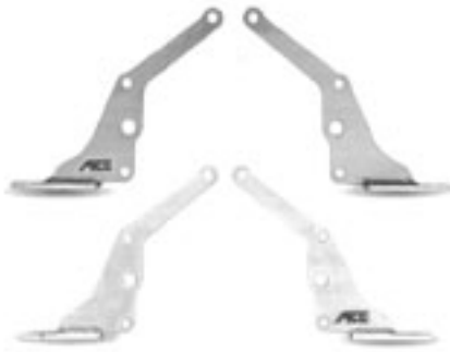
CHEVY REAR ENGINE MOUNTS STEEL REAR PAIR ALUM. REAR PAIR