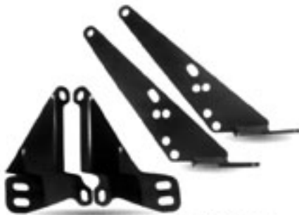
FORD ENGINE MOUNTS -REAR PAIR -FRONT PAIR