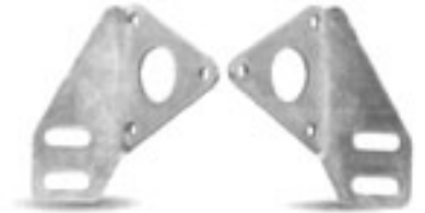
CHEVY OFFSET ENGINE MOUNTS STEEL FRONT PAIR