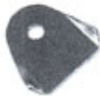
BODY TABS .085 STEEL 1/4" HOLE .085 STEEL 3/8" HOLE FLAT (SPECIFY HOLE SIZE) .125 STEEL 1/4" HOLE