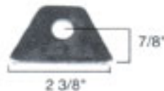
SEAT TAB 1/8" STEEL 1/2" HOLE 3/16" STEEL 1/2" HOLE 1/4" STEEL 1/2" HOLE 1/4" ALUMINUM 1/2" HOLE