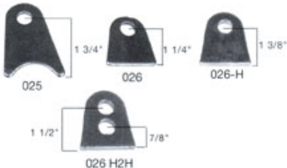
CHASSIS TABS 3/16" STEEL - 1-3/4" FROM CENTER RADIUS TO CENTER OF HOLE - FITS 1-1/2" TUBING. A - 1/2" HOLE B - NO HOLE C - 3/4" HOLE D - 3/8" HOLE 1/2" HOLE - 1-1/4" FLAT TO CENTER OF HOLE A - 3/16" STEEL B - 1/8" STEEL C - NO HOLE - 3/16" STEEL HEAVY DUTY CHASSIS TAB - 1/4" STEEL 1-3/8" FLAT TO CENTER OF HOLE. A - 1/2" HOLE B - 3/4" HOLE