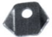
TRICK TAB 1/8" STEEL 7/16" HOLE 1/8" STEEL 3/8" HOLE 1/8" STEEL 1/2" HOLE 1/8" STEEL 1/4" HOLE