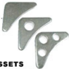
GUSSETS WITHOUT HOLE WITH ONE HOLE WITH THREE HOLES