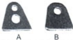
WINDOW FRAME TABS 3/16" HOLE -16 GA. STEEL 1" X 1" STEEL 1" X 1" ALUM 3/4" X 3/4" STEEL 3/4" X 3/4" ALUM