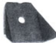
BODY TABS .085 STEEL 1/4" HOLE .085 STEEL 3/8" HOLE FLAT (SPECIFY HOLE SIZE) .085 STEEL 1/2" HOLE .085 STEEL NO HOLE