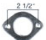
UNDER BAR FLANGE 1-1/2" DIA CENTER HOLE 7/16" SMALL HOLES. 1/4" STEEL 3/16" STEEL